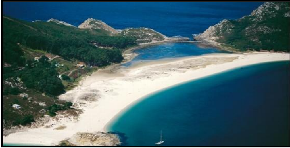
Areoso Islands, Pontevedra

Ría de Arousa, the biggest - famous for its seafood and mussel rafts